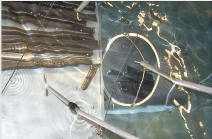
Reloading of level control probe sections into a transportable bucket

Eight standard Balduf-filters had been stored in the spent fuel pond. These were grabbed by a special Höfer & Bechtel grabber and drawn into the shielding hood. Two additional non-standard Balduf-filters first had to be prepared by special handlings before being retrieved according to the defined procedure.