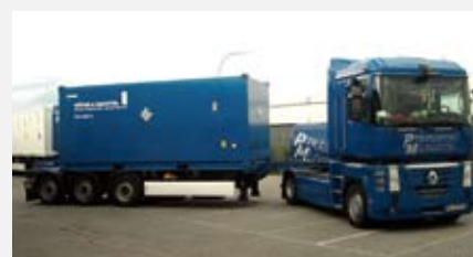
Transport of Höfer & Bechtel HKMP II boxed in an appropriate container

> By application of the two Höfer & Bechtel main cooling pump cleaning devices (HKMP) the main cooling pumps at Grafenrheinfeld NPP, Grohnde NPP, Gösigen NPP (Switzerland) and Emsland NPP were successfully cleaned in 2008.