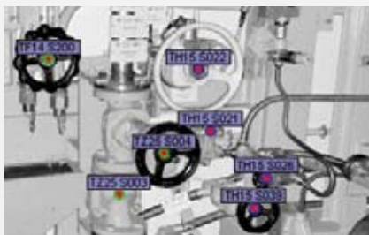
Detail of a scan showing linked PICs