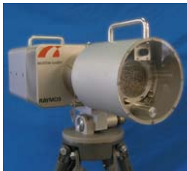
Mobile \gamma -camera with a special collimator system for minimized measuring periods in cases of low radiation intensities

In cooperation with NUKEM Technologies GmbH Höfer & Bechtel advanced a \gamma -camera-device, originally developed by NUKEM, for productive use and delivered it in three types.