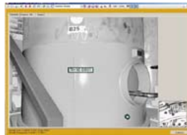
Localization of a PIC within the scan

Using the Höfer & Bechtel CLOUDIA explorer the PIC can be linked to the scan data. Now the PIC is not only visible within the scan but can also be located in the pool of scans: After keying the PIC into the search window the associated scan is opened and focused to the PIC. In this