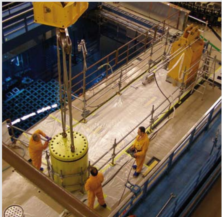
Covering of a MOSAIK-cask

Beside irradiated fuel assemblies used filters and additional rest materials are stored in the spent fuel pond before further treatment. At Grafenrheinfeld NPP these filters and materials should be retrieved, packed into 200l drums and brought to the drum store. In detail there were Balduf-filters, NTG-filters, level control probes and various buckets filled with small parts. First Höfer & Bechtel was ordered to develop a concept for the conditioning procedure and later to realize the disposal itself. ➤