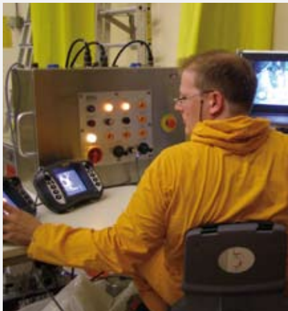
Control of grab and camera